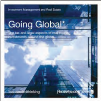
Going Global Real Estate CD-Rom