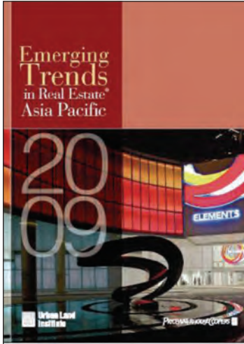
Emerging Trends in Real Estate® Asia in conjunction with the Urban Land Institute