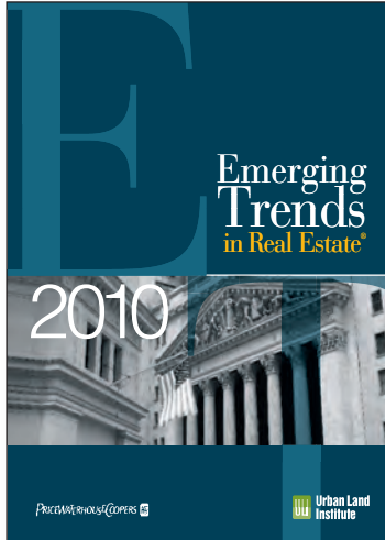
Emerging Trends in Real Estate® USA in conjunction with the Urban Land Institute