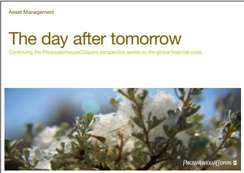
The day after tomorrow