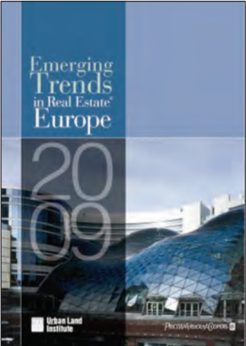
Emerging Trends in Real Estate® Europe in conjunction with the Urban Land Institute