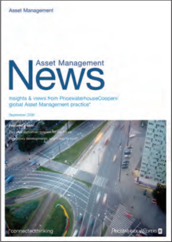
Asset Management News