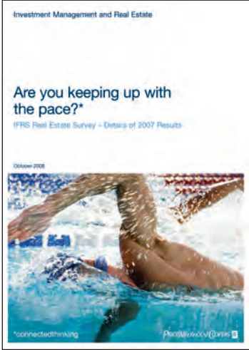
Are you keeping up with the pace? IFRS Real Estate Survey