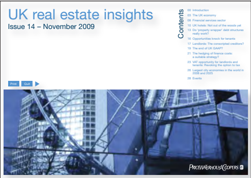
UK Real Estate Insights