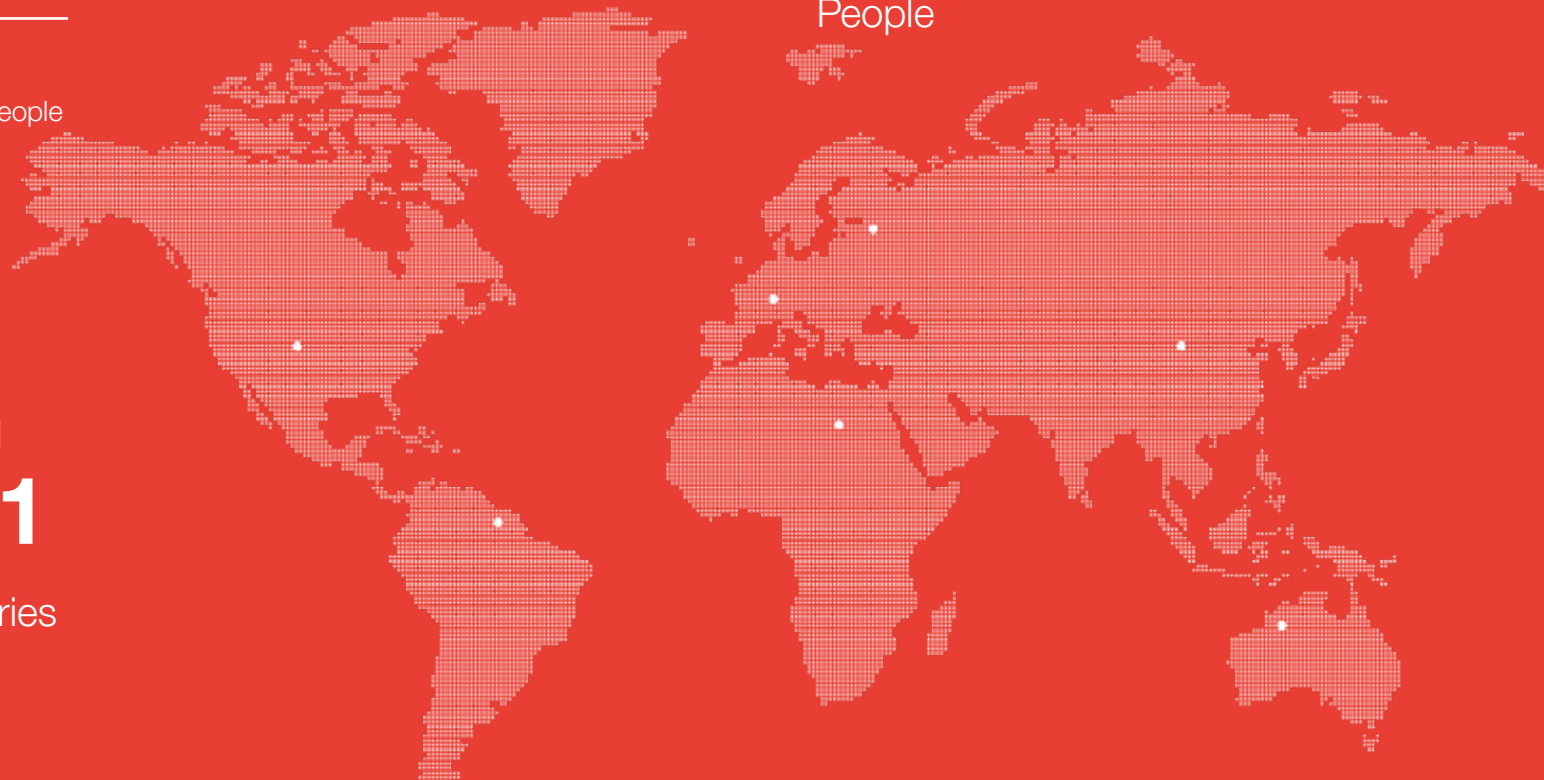
Figure at December 2022

Australia & Pacific Islands 10,345 people