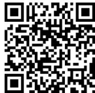
Financial Services Assurance