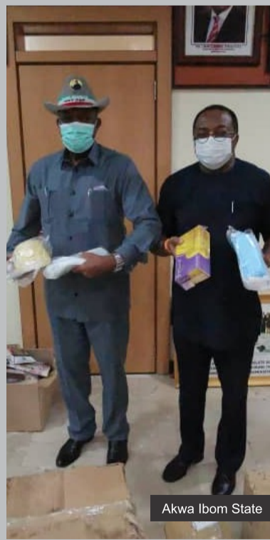
Akwa Ibom State