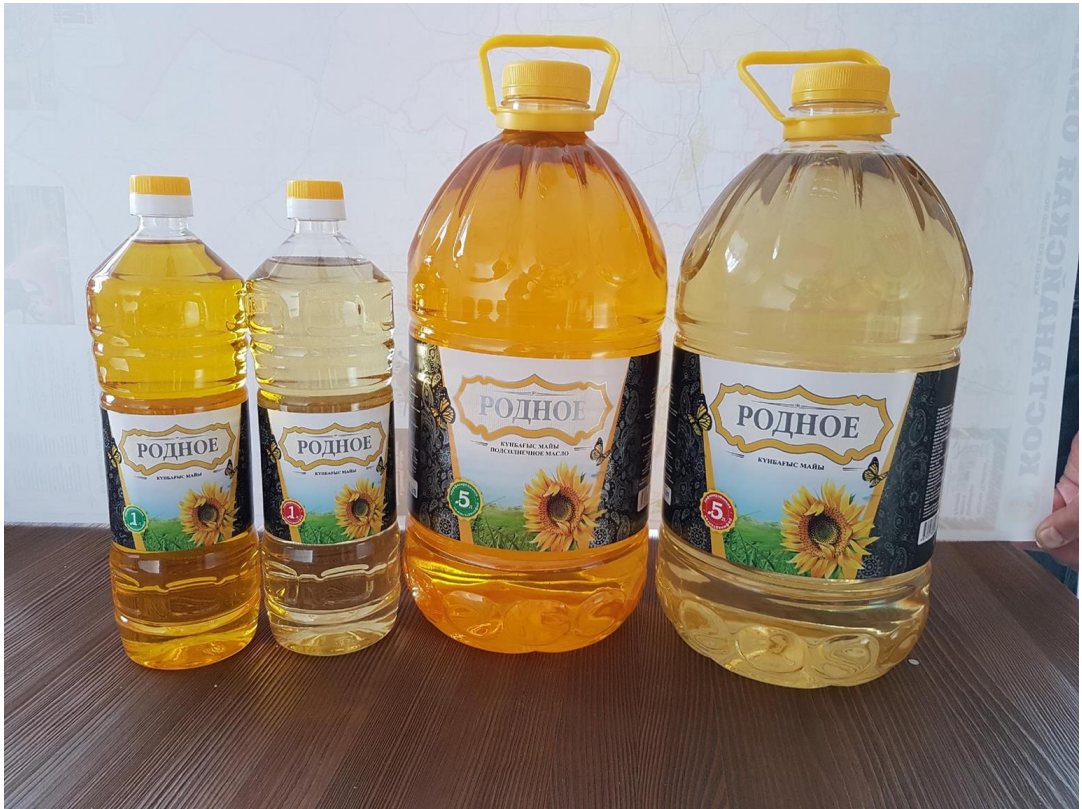
Photo of the product