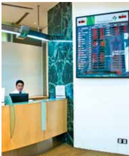
BI lowered its policy interest rate in October and November 2011

However, the central bank has taken steps to address this issue. As of March 2011 BI has required that all lenders with assets above Rp10trn ($1.2bn) publicly announce their prime rates – the rates without the risk component – for corporate, retail and consumer credit. The idea was to foster competition, but BI data show that three months later rates were holding at similar levels. BI tracked the rates of more