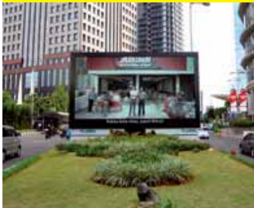
Developments in 2011 point to higher levels of competition ahead