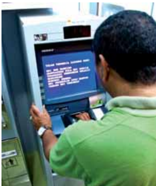
Loans to SMEs grew at a CAGR of 21.1% between 2005 and 2010

As of June 2011, total outstanding loans amounted to Rp1951trn ($234.1bn), representing 23% year-on-year growth. Of this total, about 50% was accounted for by working capital loans.