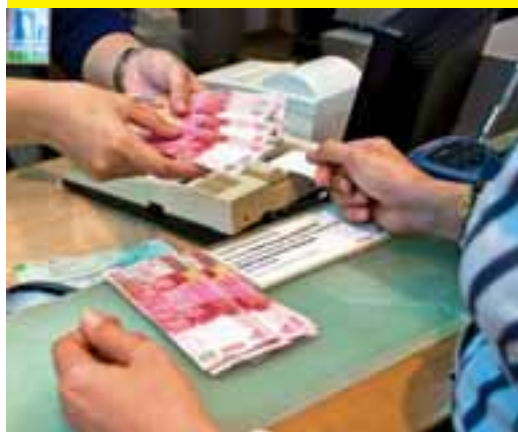
The corporate tax rate is 25% on net taxable income