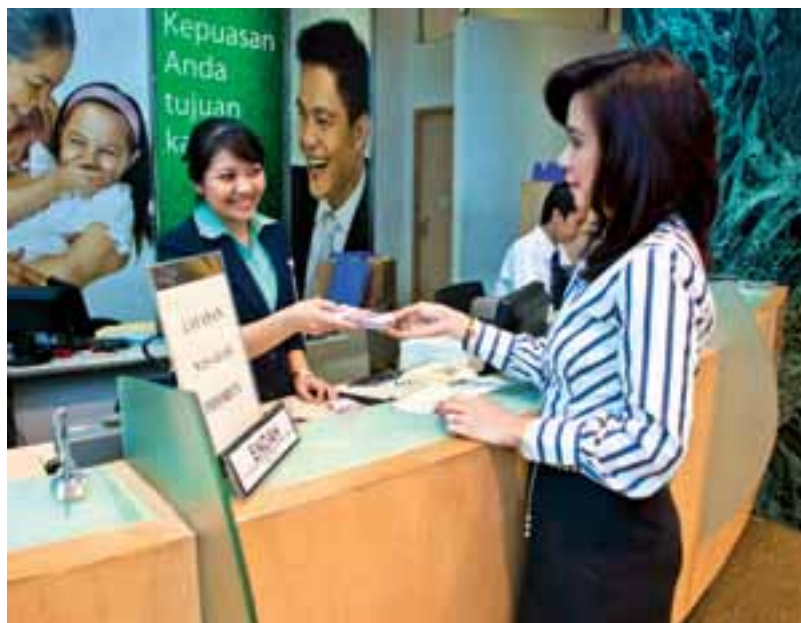
Since March 2010, banks that do not keep loan-to-deposit ratios between 78% and 100% face penalties

While Temasek and Khazanah have each since merged their multiple banks into single institutions, the Indonesian government asked BI for an exemption from the rule until 2012. The exemption was granted, and what happens next for the four state-owned banks in Indonesia is unclear.