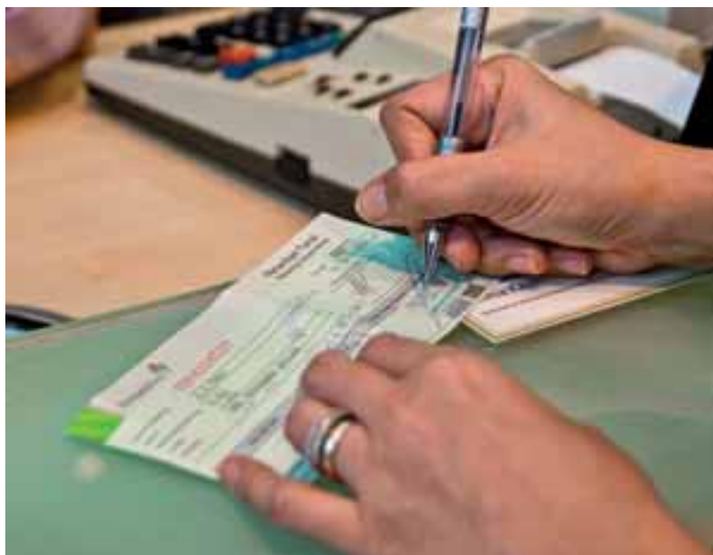
The government is committed to continuing reform of the tax system to promote foreign investment

The ITO has introduced profitability benchmarking based on taxpayer industries. The benchmarking is based on analysis conducted internally by the DGT and is intended to be used in assessing the risk profile of Indonesian corporate taxpayers as a tool in its audit selection process. Taxpayers with profitability that falls below the DGT benchmarks for their industry may be