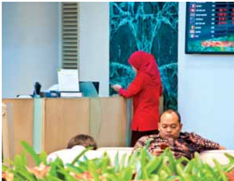
Only certain types of businesses can formally establish a branch operation, including banks

months of the receipt of the objection decision. To the extent that the objection decision calls for a payment of tax due, according to the Tax Court Law, at least 50% of the tax due must be settled before filing the appeal. As set out in the General Tax Provisions and Procedures Law, the taxpayer is only required to pay an amount agreed in the tax audit closing conference. This creates a mismatch and taxpayers are generally advised to pay the 50% amount to ensure the Tax Court accepts the case. However, recently the Tax Courts have interpreted that the tax due refers to the amount agreed by the taxpayer as stated in the objection or appeal, which was already paid in full, and hence no additional tax in dispute needs to be paid.