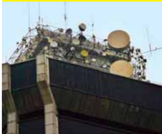
Studies indicate tower sharing may soon replace separate networks