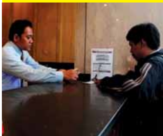
The country's banks held assets worth nearly $400bn as of mid-2011