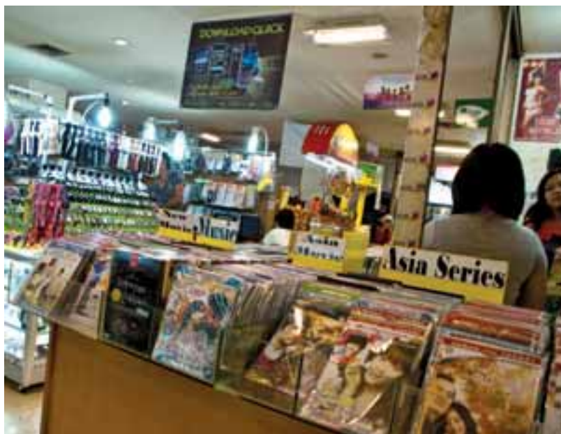
Value-added tax is due on virtually all transactions involving the transfer of goods or provision of services

is 15%. Dividends received by individual taxpayers from an Indonesian company are final-taxed at 10%. The importation of goods into Indonesia is also subject to WHT at 2.5% (if an import licence is held) or in other cases 7.5%. This WHT represents a pre-payment of the taxpayer's annual income tax.