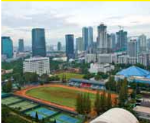
Much of the work will take the form of public-private partnerships