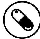
Pharmaceuticals and Life sciences