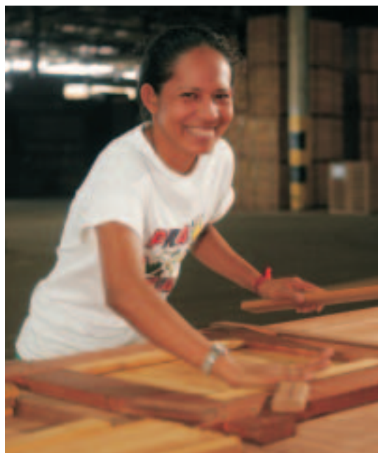
Fig. 14 Precious Woods staff member

The legal and customary rights of indigenous peoples to own, use and manage their lands, territories and resources shall be recognised and respected.