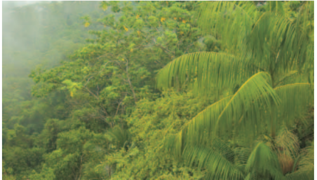
Fig. 10 Landscape at Lapa Rios