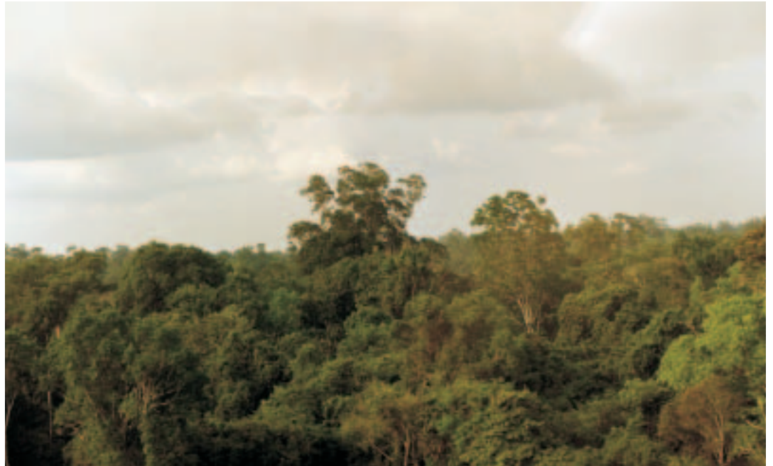
Fig. 7 Intact forest belonging to Precious Woods four years after the harvest