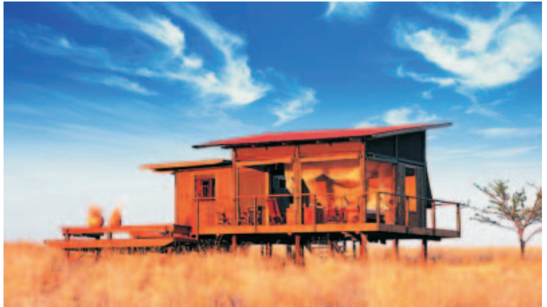
Fig. 5 Wolwedans - Dune house

Wolwedans: the biggest nature reserve in Southern Africa