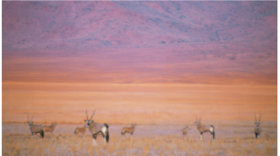
Fig. 17 Oryx at Wolwedans

Possible risks arise from deterioration in security in the respective region as a result of terrorist attacks, ethnic tensions and war and the appearance of diseases such as SARS and bird flu. Further risks for foreign investors include land reform (as in the case of Namibia) or land-use conflicts (as in the case of Costa Rica). A thorough analysis of the political risks is therefore critical for success.