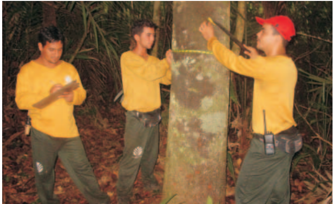
Fig. 19 Measuring trees to determine growth rates at Precious Woods