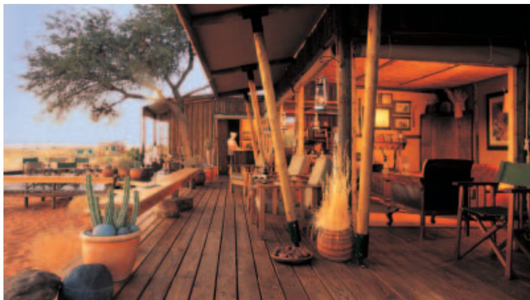
Fig. 9 Wolwedans

The case studies 'Wolwedans' (Namibia) and 'Lapa Rios' (Costa Rica) are tourist enterprises whose business concepts envisage the responsible use of the region's natural resources and responsible interaction with the social environment. They act in compliance with the criteria for environmentally friendly and socially compatible tourism set out below or they are striving to comply with these criteria.