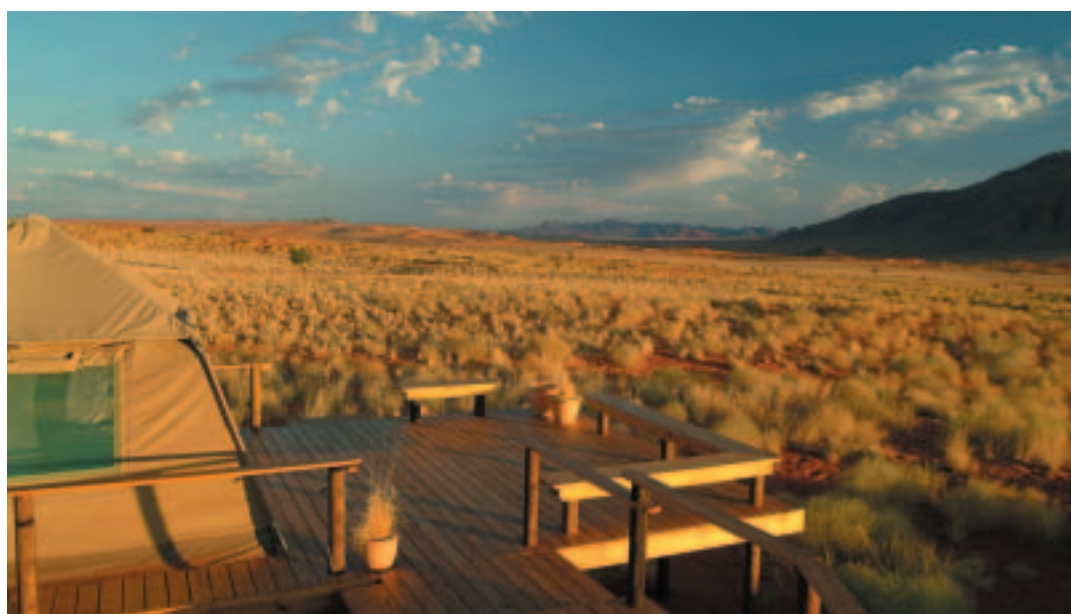
Fig. 11 Tent Platform - Wolwedans Dune Camp

Tourism can only be as responsible as the behaviour of the tourists themselves. This means providing a minimum of information about the culture and society of the host country and the surrounding natural environment. Respecting the culture and traditions of the local people is essential. Tourism should also promote responsible behaviour through personal meetings with local people. Knowledge about the natural habitats and species encourages appropriate behaviour. In addition, tourists are multipliers and they can have considerable influence on public opinion about the destination and the value of biodiversity upon their return.