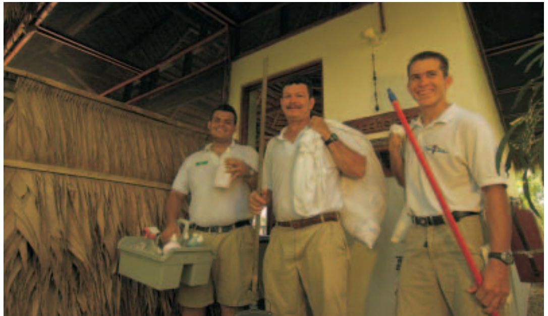
Fig. 21 Service team in Lapa Rios