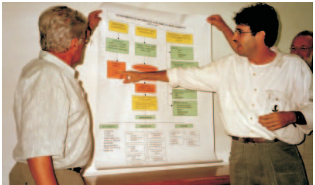
Fig. 22 FSC seminar at Precious Woods

If an existing natural forest is acquired, harvesting can already commence in the first year of operation, thereby ensuring early cash flows and low financing needs. On the other hand, in forest plantation projects, the period between planting and the first harvest lasts several years. The length of the growth phase of the plantings depends on natural growing conditions, the types of trees used and the products to be sold.