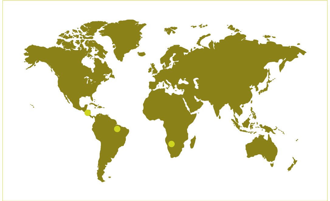
Fig. 3 Geographical location of the reference projects. 2

In order to assess the economic viability of conservation projects, three reference projects in Costa Rica, Namibia and Brazil on sustainable tourism and ecological forestry have been examined.