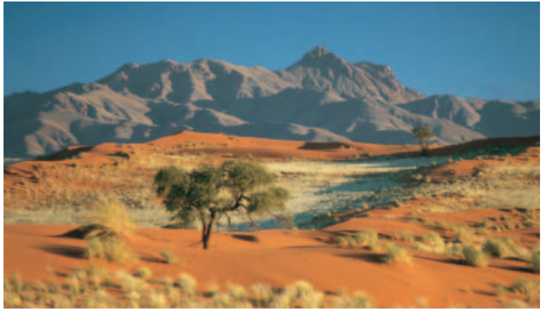
Fig. 2 NamibRand nature reserve

This study investigates profit-orientated projects that preserve biological diversity