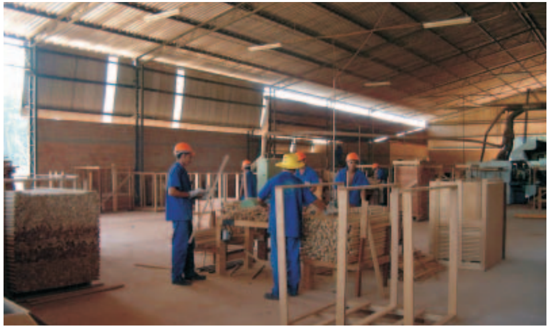
Fig. 18 Production site at Precious Woods

There is also an extensive portfolio of harvestable types of timber in the area of natural forest management. Companies can therefore react flexibly to market changes and switch to the production of goods with higher profit margins.