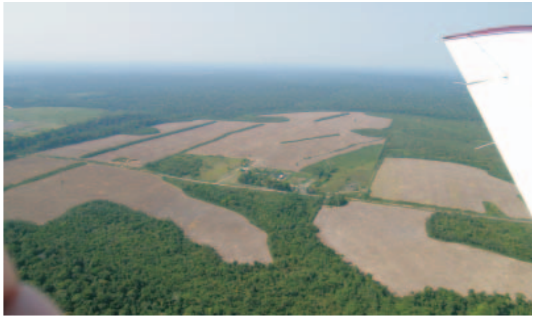
Fig. 12 Typical use of the Amazon forest to date: soy bean cultivation (fields adjacent to Precious Woods)

The ‘forest management’ case study ‘Precious Woods’ complies with the strict sustainability criteria of the Forest Stewardship Council. The natural forest operation of Precious Woods in the federal state of Pará (Brazil) has already been certified according to these criteria. From a nature conservation viewpoint therefore, Precious Woods meets the requirements for environmentally and socially compatible forest management.