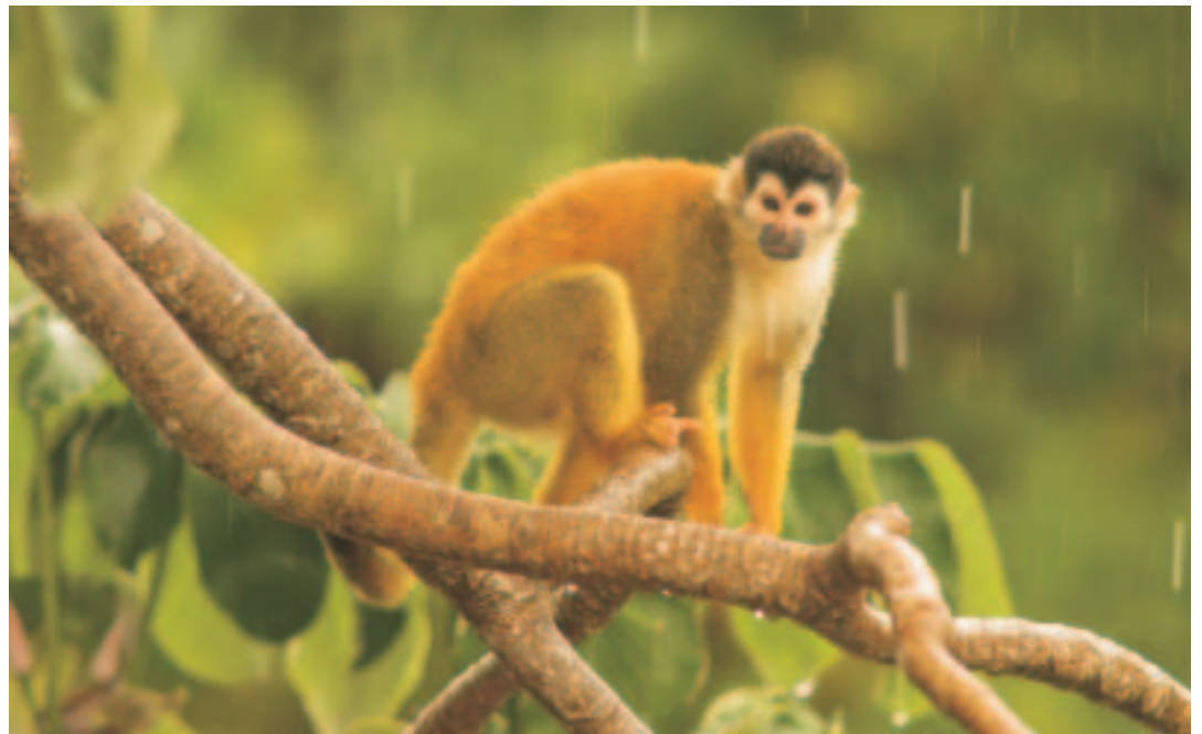
Fig. 1 The fauna of Lapa Rios

In areas where it is not possible to make sustainable forms of land use economically attractive, natural habitats must frequently give way to agricultural monocultures. In many cases this causes the permanent destruction of biodiversity, which usually means that the possibility of environmentally compatible use is lost for future generations.