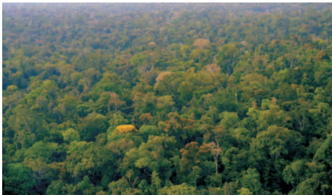
Fig. 13 Forest with blooming Ipé at Precious Woods, four years after harvest

Higher prices and access to new markets possible