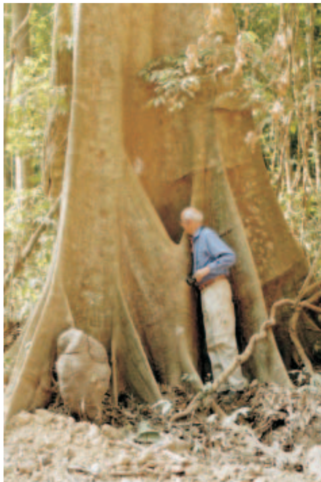
Fig. 8 Tree in Precious Woods forest

Total potential earnings of 600 to 2,500€/ha over a period of about 20 years