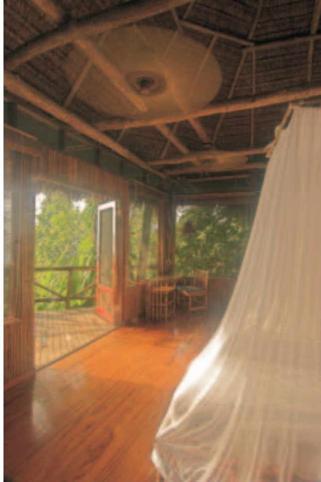
Fig. 6 Nature tourism in Lapa Rios