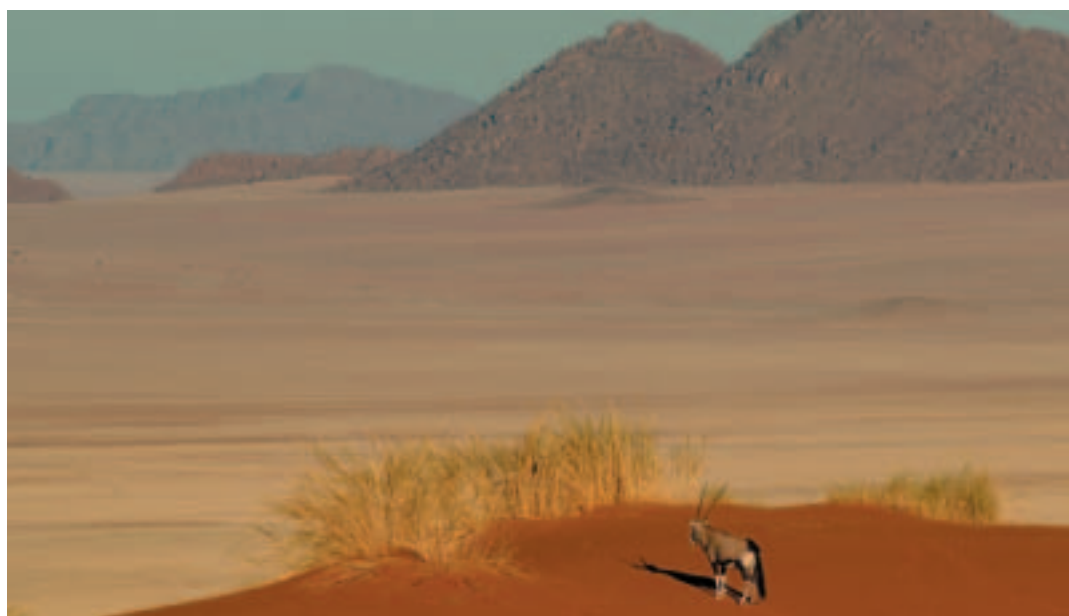
Fig. 20 Landscape at Wolwedans

Important factors affecting the performance of tourism-orientated concepts are described below.