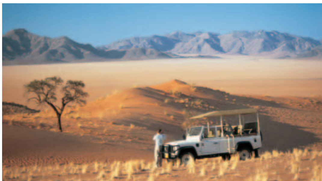
Fig. 16 Activities in the NamibRand nature reserve

Opportunities for projects in nature tourism arise as a result of the long-term growth in the tourism sector as foreseen by the World Tourism Organisation (WTO): with a workforce of about 234 million, this sector (directly or indirectly) employs about 9% of all employees worldwide. Between 2003 and 2004, the number of arrivals worldwide rose by almost 11% to 763 million. In 2005 the number rose again by 5.5% to a record of 800 million. 42 The World Travel and Tourism Council (WTTC) predicts an annual growth of demand in the tourism sector of 4.2% in real terms over the next 10 years. 43 Results by region show that Africa recorded the highest growth in arrivals in 2005 (+9%), followed by Asia and the Pacific (+8%), the Middle East (+8%), the Americas (+6%) and Europe (+4%). 44