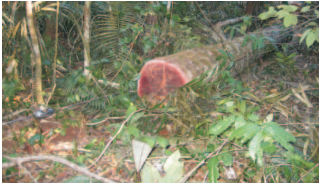
Fig. 15 Carefully dragging a trunk using a cable winch at Precious Woods

Management activities in high conservation value forests shall maintain or enhance the attributes that define such forests. Decisions regarding high value forests shall always be considered in the context of a precautionary approach.