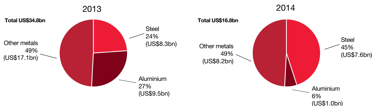
Figure 4: Dealmaking by industry sector (by target)

Note: Total deal values are rounded to a single decimal place. The % change column reports accurate percentage change in total values before rounding and may differ from the percentage change in rounded values.