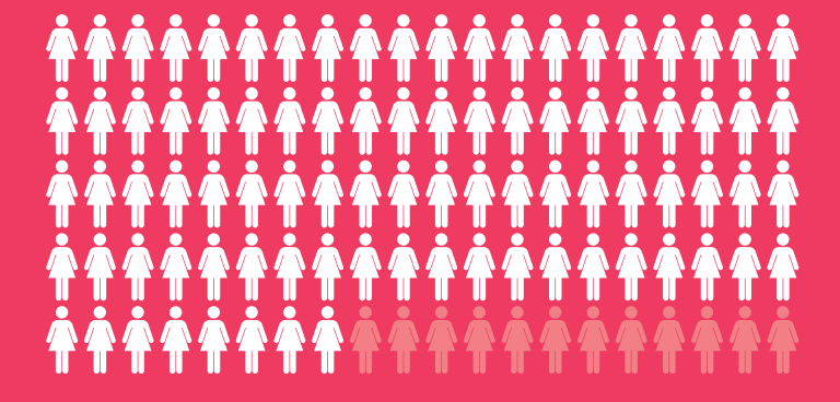
88% of women working in FS feel gaining international experience is critical to furthering their career