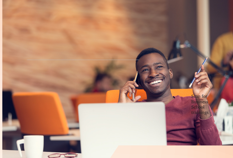
Scan for Business School trainings