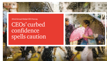
22 Annual Global CEO Survey: CEO's curbed confidence spells caution