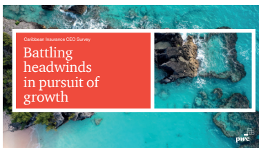
Caribbean Insurance CEO Survey: Battling headwinds in pursuit of growth