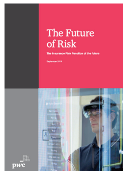
The Future of Risk: The insurance Risk Function of the future