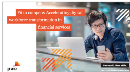
Fit to compete: Accelerating digital workforce transformation in financial services