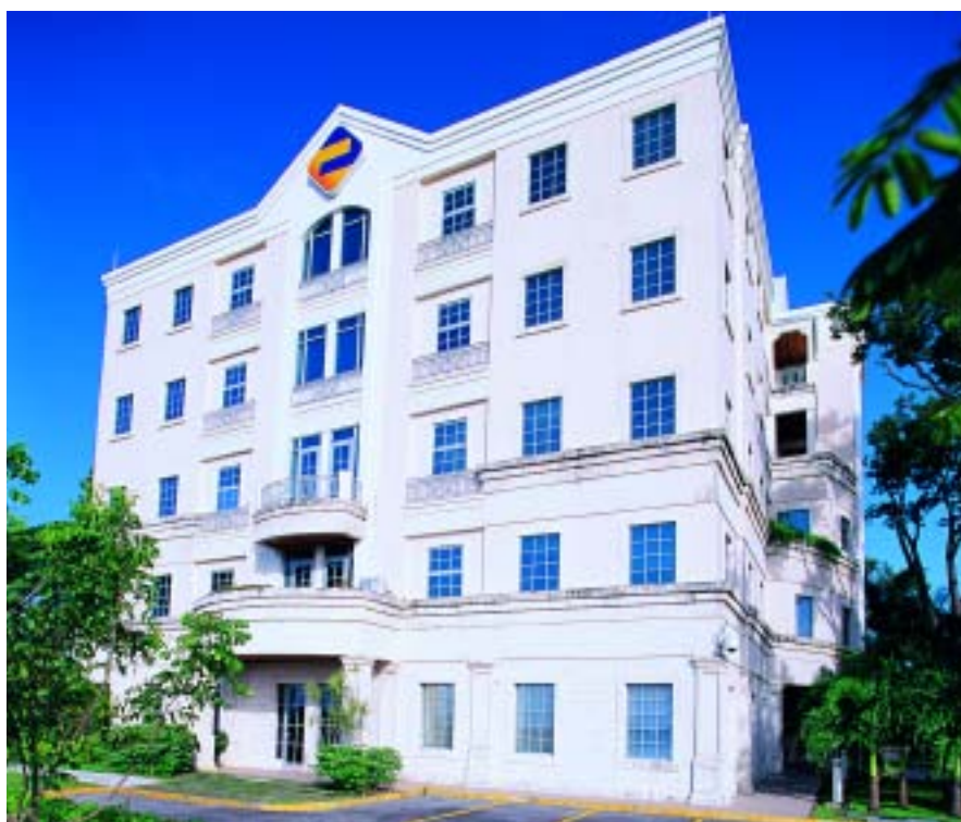
Top: The Tom Adams Financial Centre, named after the island's second prime minister, is home to the Central Bank of Barbados.