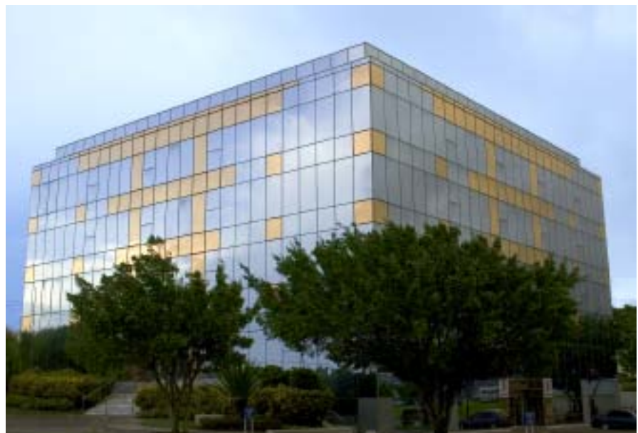
Top: High quality executive housing is available for sale or rent in many parts of the island.