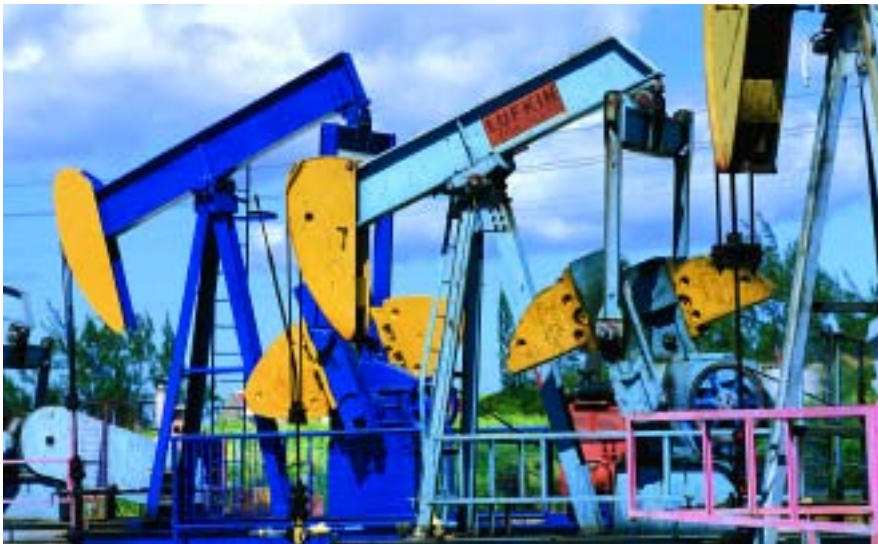
Local crude oil production meets about half the islands domestic requirements.

on this commodity and to encourage diversification, especially in vegetables, poultry, livestock and fishing. The island is virtually self-sufficient in pork, poultry, fresh milk and vegetables.