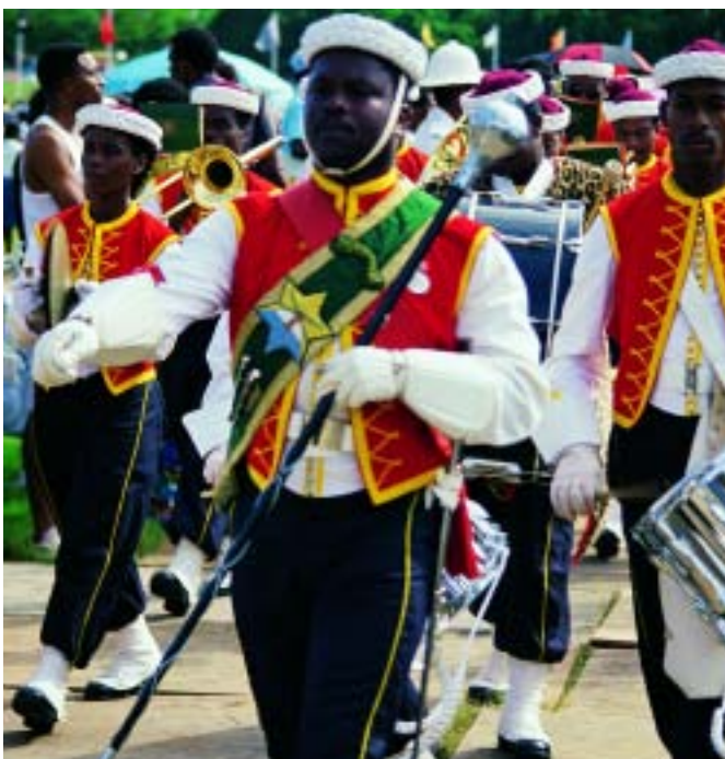
The Corp of Drums of the Barbados Defence Force wear uniforms that date back to Victorian times.