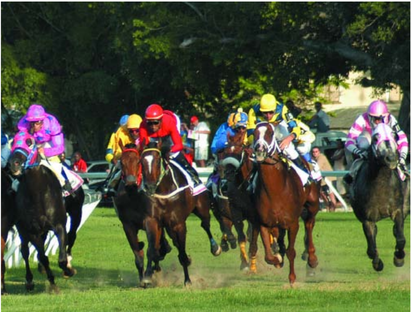
Horseracing is a well-established and popular sport on the island.

Barbados has gained increasing profile in recent years as a golfing destination. There are five golf courses on the island: two 18-hole courses at Sandy Lane, which have been recently designed by Tom Fazio; the luxurious 18-hole course at Royal Westmoreland, designed by Robert Trent Jones; the 18-hole