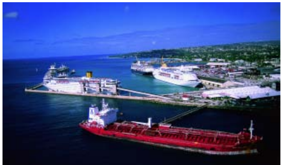
Top: Barbados enjoys excellent telecommunications links with the rest of the world.