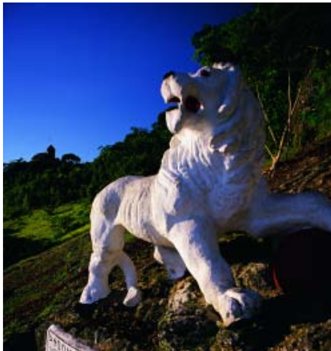
Carved by a British army officer stationed on the island, this stone lion is a reminder of Barbados' colonial past.

In 1966, after almost 350 years of unbroken British colonial status, Barbados became a fully independent sovereign nation. The island is English-speaking and has remained a member of the British Commonwealth.