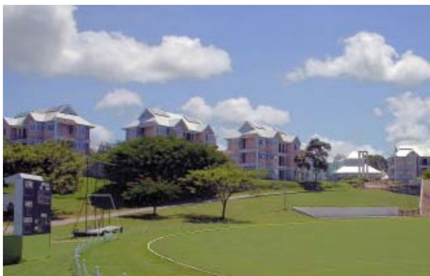
Top: The Sherbourne Conference Centre – one of the most modern facilities of its kind in the Eastern Caribbean.