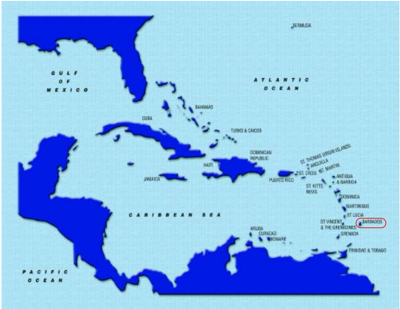
Barbados is the most easterly of the Caribbean islands, situated about 1600 miles southeast of Miami, Florida.