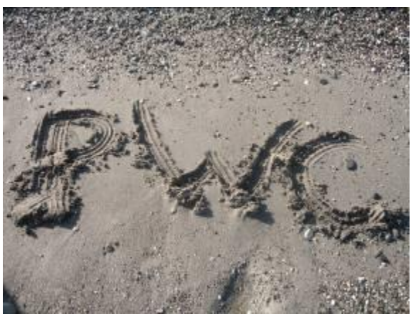
Available Assurance services include:

PwC' knowledge and experience enables our specialists to advise not only on assurance matters, but also to put them in context and to advise on the likely impact that the pace and direction of economic and financial change will have on a commercial activity in Armenia.