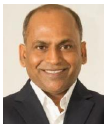
Terry Netto People Potential Asia Pte Ltd

Trainer's involvement in the workshop is subject to availability and PwC reserves the right to appoint the most appropriate trainer.