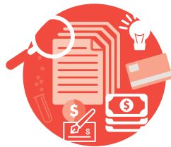
Payroll Outsourcing Services