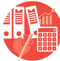
Accounting and Bookkeeping Services