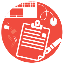
Company Secretarial Services

We aim to deliver value through our service offerings that can be tailored and scaled to suit your individual business needs. Our dedicated CSS team can provide the following services: