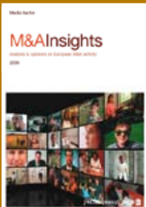
M&A Insights Media Sector