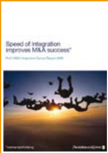
Speed of integration improves M&A success