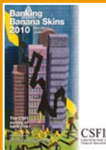
Banking Banana Skins