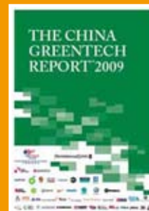
The China Greentech Report 2009