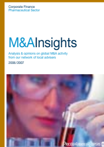
M&A Insights Pharmaceuticals