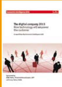
The digital company 2013