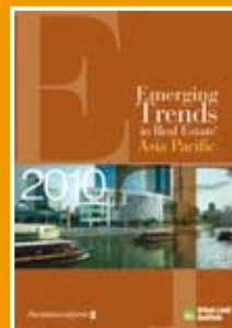
Emerging Trends in Real Estate Asia Pacific 2010