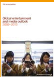
Global Entertainment & Media Outlook 2009 – 2013