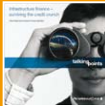
Infrastructure finance – surviving the credit crunch