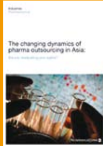
The changing dynamics of pharma outsourcing in Asia