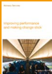
Improving performance and making change stick