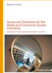
Retail & Consumer