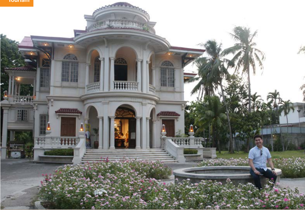
The Yusay-Consing Mansion, popularly known as the Molo Mansion, is a significant and historic house in Molo, Iloilo, facing the town plaza and the St. Anne Parish Church. It was built in the 1920s.