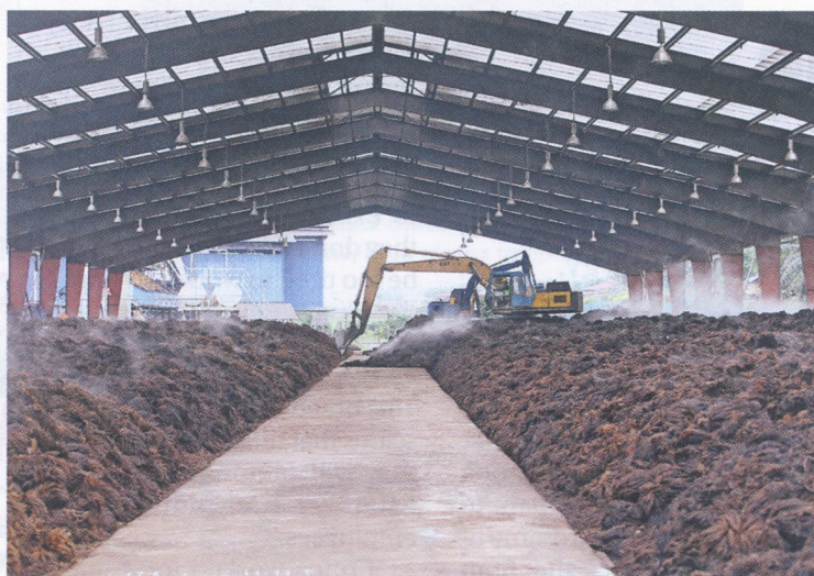
A compost plant. One way of reducing carbon emissions on plantations is to work out exact quantities of fertiliser to apply to plants, a strategy known as 'smart precision agriculture'