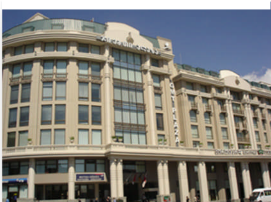
Tbilisi – Courtyard Marriott