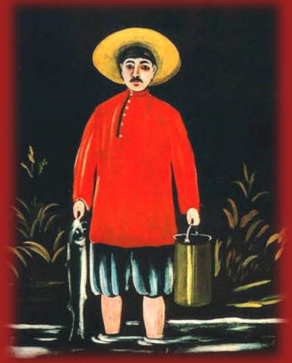
Fisherman by Niko Pirosmiani