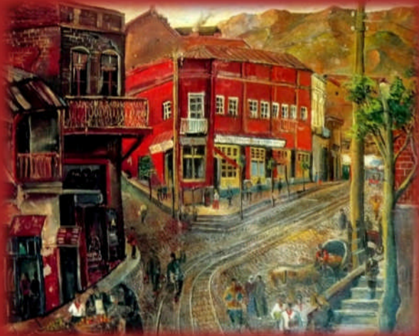
Tbilisi by Elene Akhvlediani