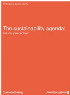
The sustainability agenda: Industry perspectives