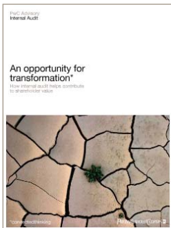
An opportunity for transformation