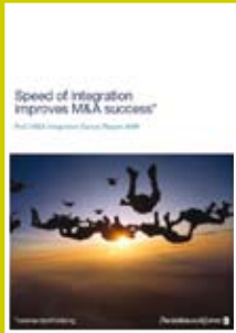
Speed of integration improves M&A success