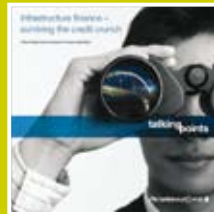
Infrastructure finance – surviving the credit crunch