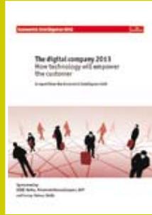
The digital company 2013