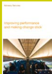
Improving performance and making change stick