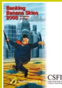
Banking Banana Skins