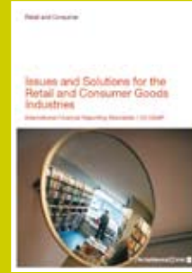
Retail & Consumer