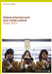
Global Entertainment & Media Outlook 2009 – 2013