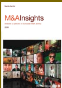
M&A Insights Media Sector