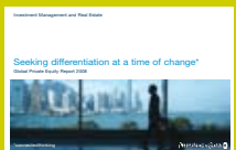
Global Private Equity Report 2008