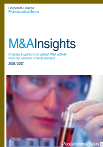
M&A Insights Pharmaceuticals