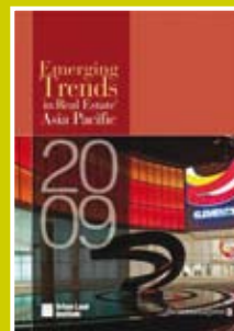
Emerging Trends in Real Estate Asia Pacific 2009