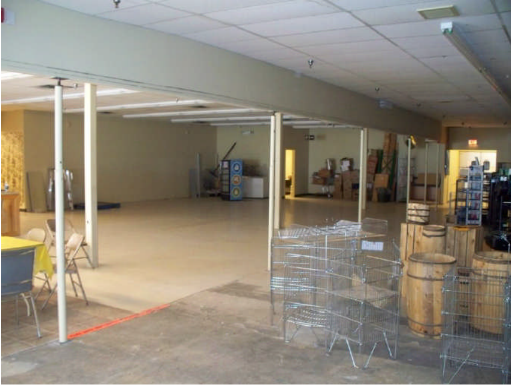
Looking northward showing interior of the hardware section