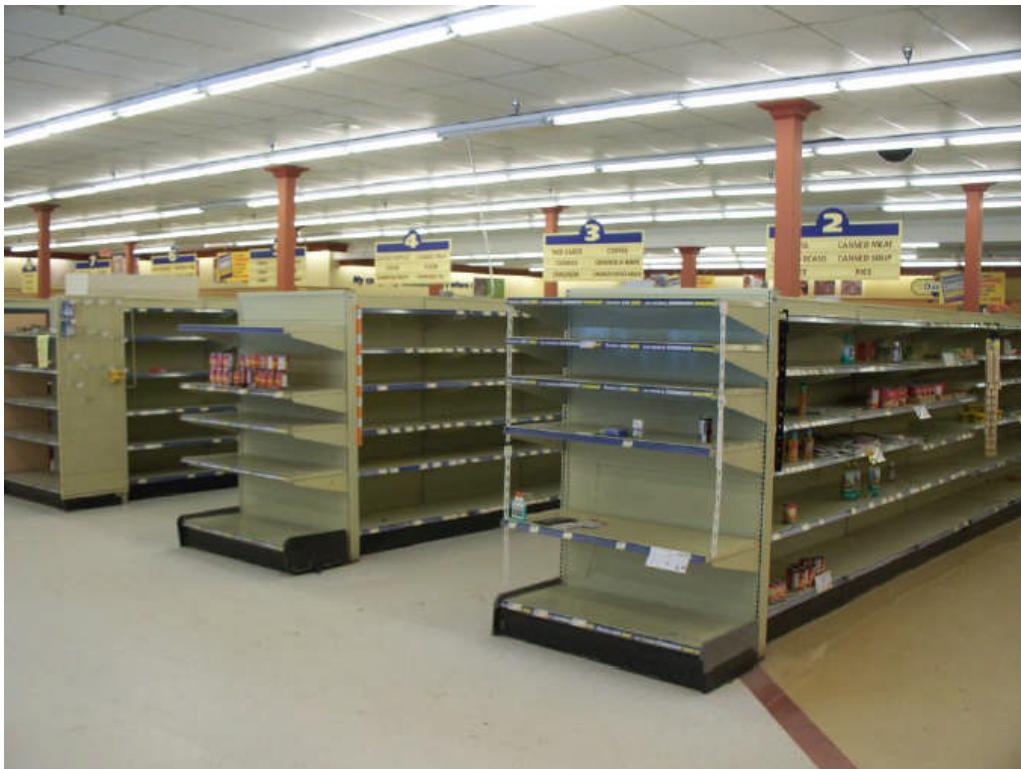
Looking northeast showing retail grocery section