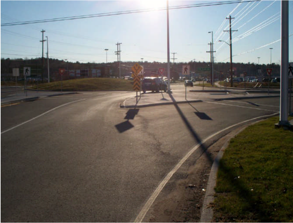
Looking westward along Commercial Street from front of property