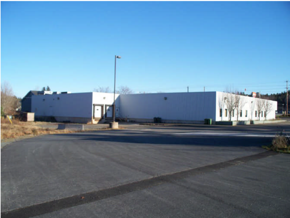
Looking southeast showing the rear of the building