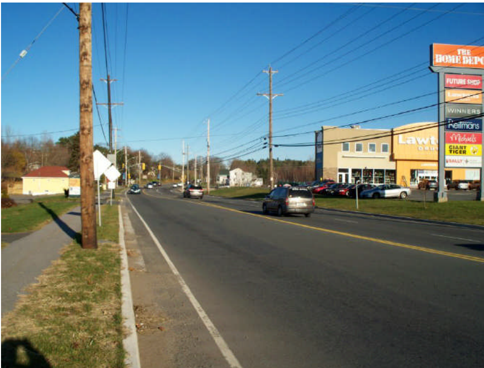
Looking eastward along Commercial Street from front of property