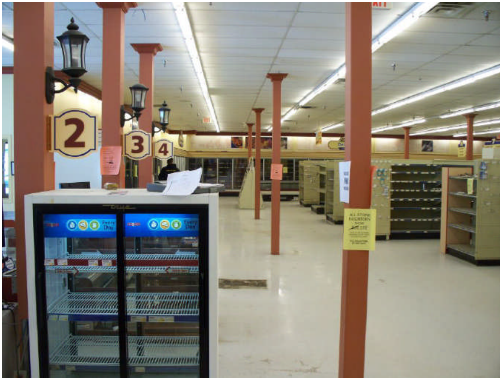
Looking northward showing retail grocery section