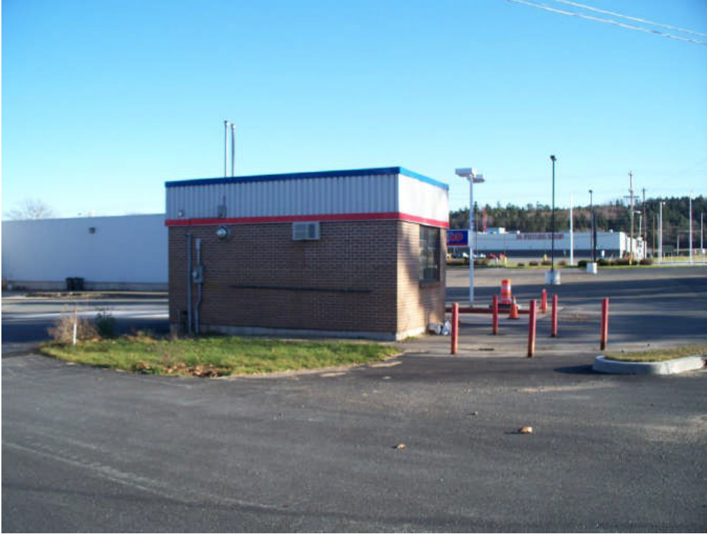
Looking southward showing gas kiosk