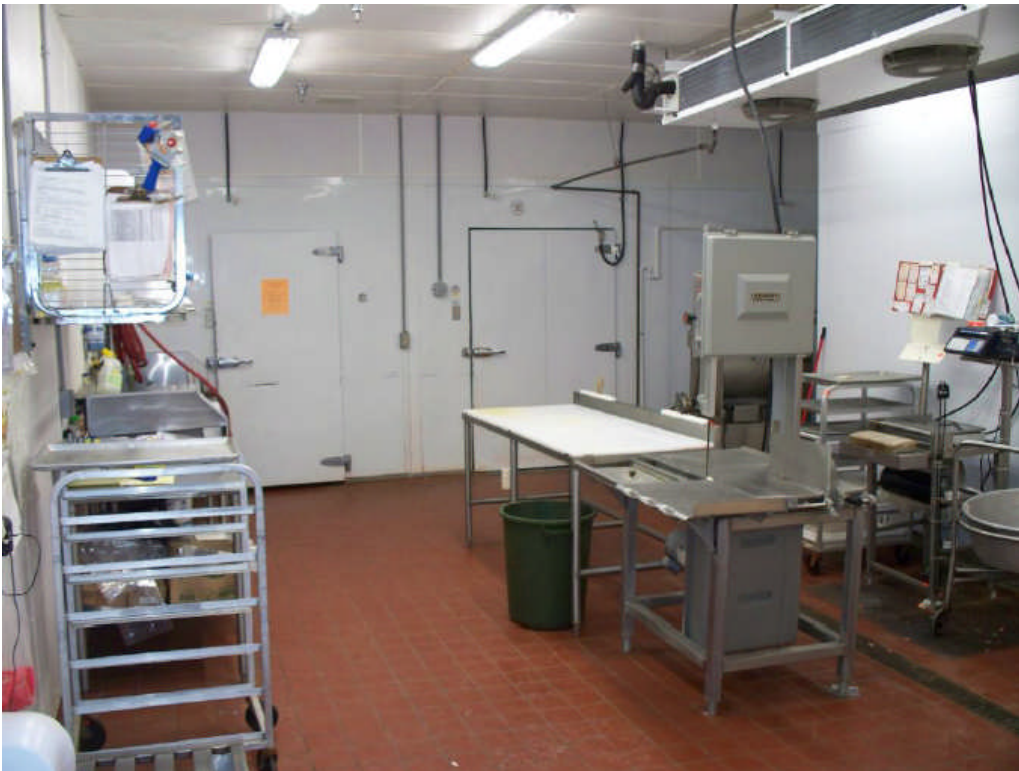
Looking eastward showing meat shop