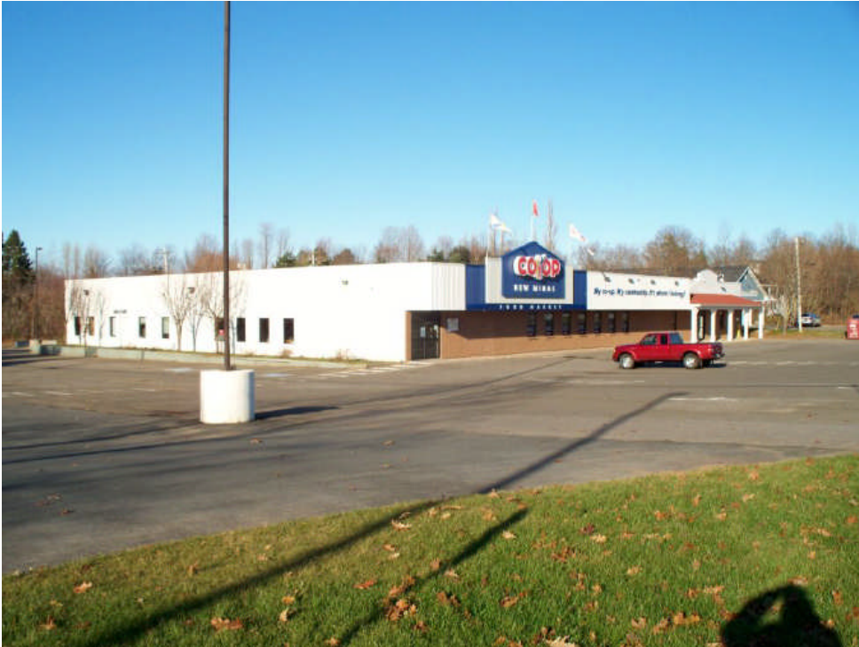
Looking northeast showing the front of the building