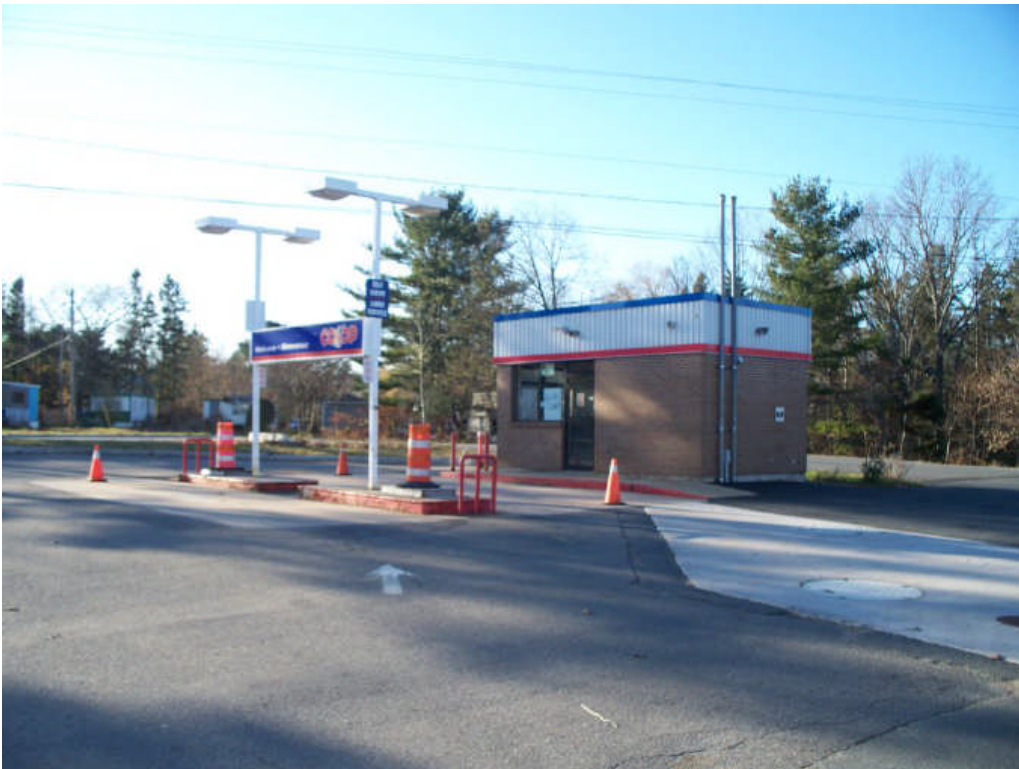
Looking northward showing gas kiosk