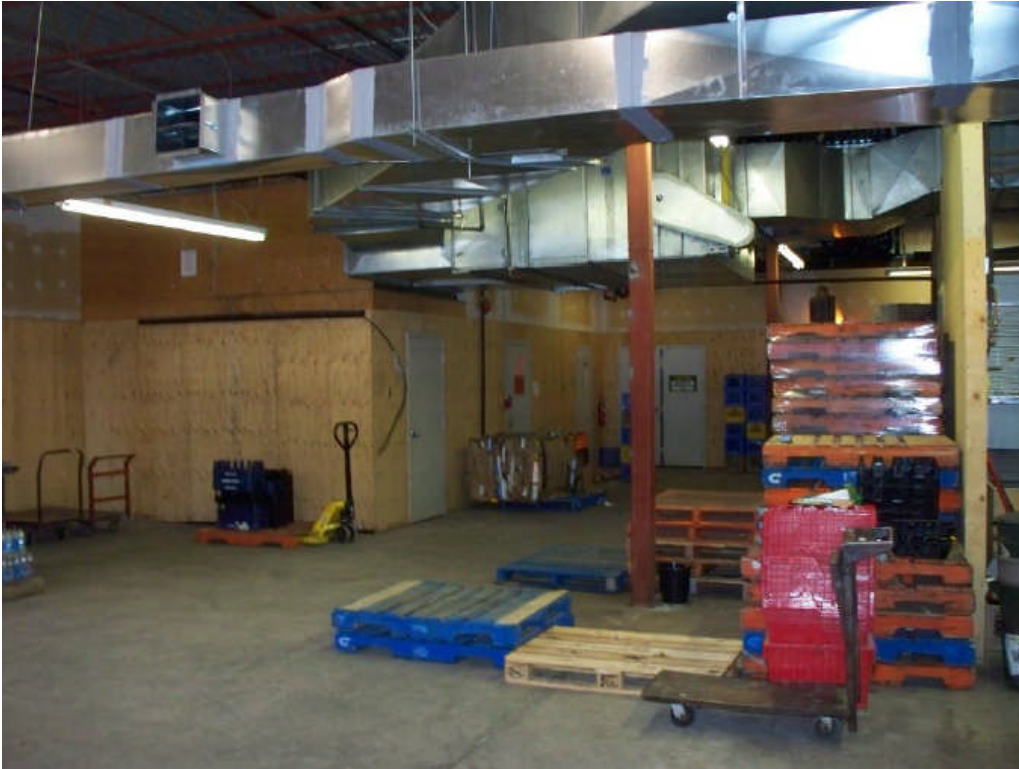
Looking eastward showing warehouse